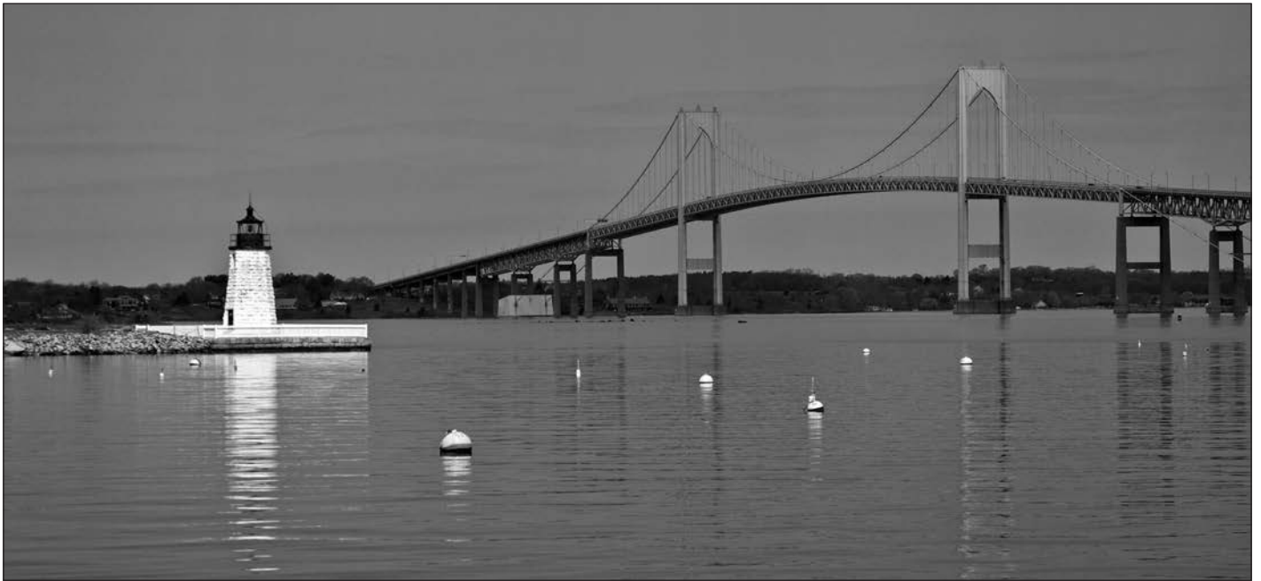
The lighthouse with the Newport Bridge, also known as the Claiborne Pell Bridge, in the background.

foundation of the keeper's dwelling and signaling the end of the staffed light station on Goat Island. Charles Schoeneman retired during the following year, and the keeper's house was demolished. The light was electrified, and personnel from the torpedo station took over its operation. The light was automated in 1963.