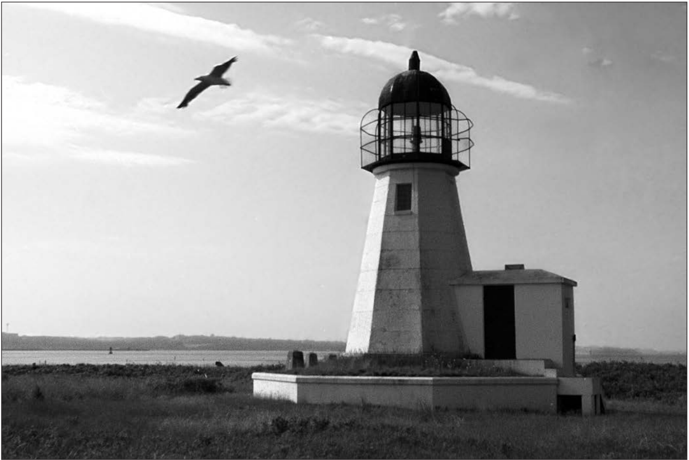
Prudence Island Lighthouse, moved from Newport in 1851, as it looks today. The keeper's house at Prudence Island was destroyed in the great hurricane of September 21, 1938. The keeper survived the storm, but his wife, a son, a former keeper, and a visiting couple all lost their lives.

was darkened by smoke and the reflectors were dirty. He also offered the opinion that the six lamps, rather than eight, would be sufficient for the lighthouse's purpose.