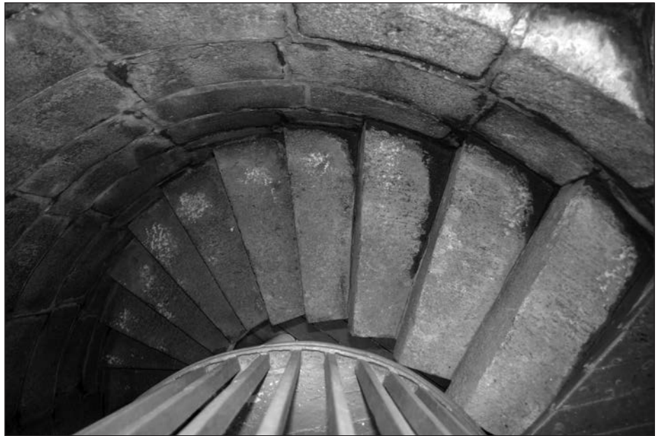
Above and top right: The stone stairs in the tower. Photos by the author. Below: The ladder to the lantern room. Photo by the author. Right and bottom right: Early 1900s post-cards, from the collection of the author.