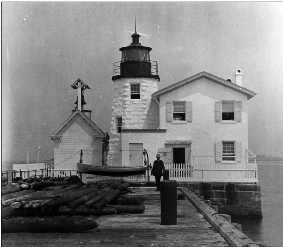
Circa 1884 photo of Newport Harbor Light Station. The keeper's house and outbuildings no longer stand.