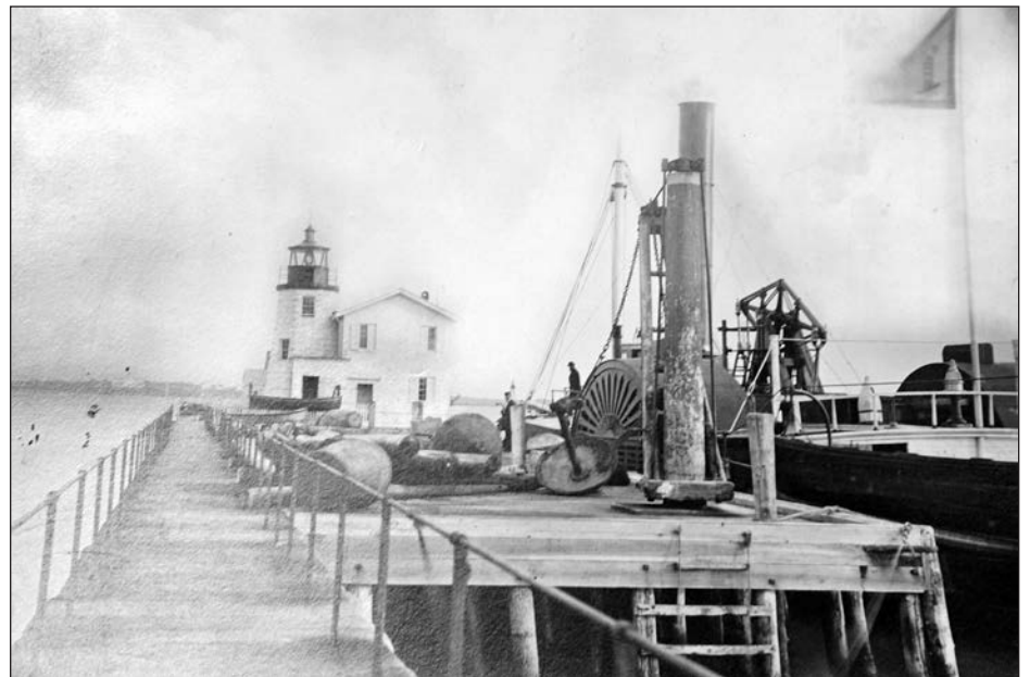
Late 1800s photo of Newport Harbor Light Station, with a steamship at the wharf.