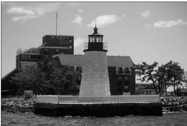
The lighthouse shares Goat Island with a Hyatt Regency hotel.

This article is adapted with the publisher's permission from a chapter in the book The Lighthouses of Rhode Island , originally published in 2006 and soon to be released in summer 2016 in a new updated edition by Commonwealth Editions, an imprint of Applewood Books.