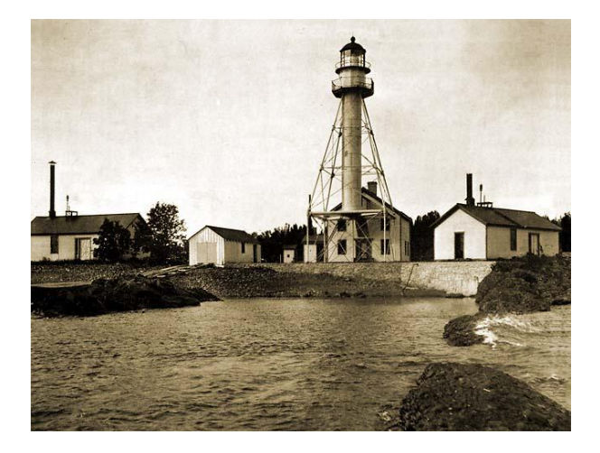
lampist —In the lighthouse service, an individual specially trained to service and repair the optics or lighting mechanisms.

light station —A series of structures making up a light station. They could consist of a keeper's dwelling or dwellings, sound system building, coal house, boat house, oil house, privy, dock, radio beacon antenna and the tower. The correct term is light station, not lighthouse. (Pictured is Manitou Island Light Station, Michigan, from the U.S. Coast Guard Historian's files.)