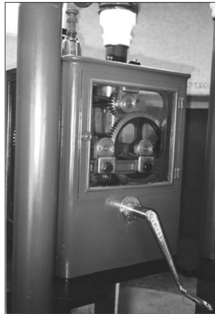
The ancient clockwork of the Lantern.

In 1898 the olive oil was replaced by acetylene gas and in 1904 by compressed oil. In 1936 the lantern was electrified. The ancient clockwork device was replaced by a new electric ball-bearing rotating system, but the old one is still kept in the lighthouse.