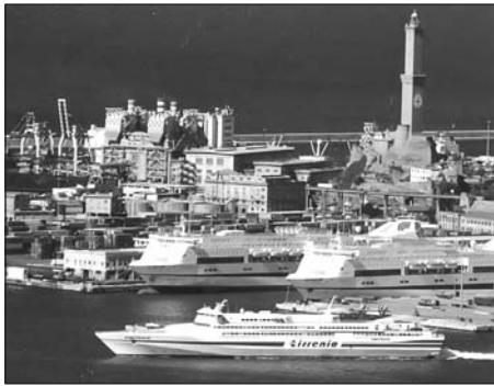
The harbor of Genoa and the Lantern today.