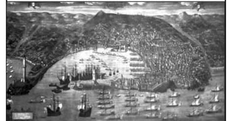
The Lighthouse of Genoa—a painting by G. Grossi in the 16th century. Maritime Museum of Pegli.

A painting dating back to the 16th century shows the harbor of Genoa with its semicircular shape. On the west side can be seen the Lantern, and on the east side there is another lighthouse that does not exist anymore and whose story was lost a long time ago. It is only known that its name was the "The Greek's Tower" because all ships coming from Greece used to cast anchor under this light. No more can be said.