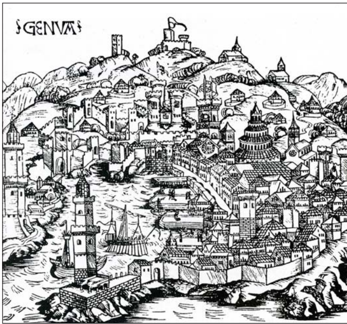
The harbor of Genoa in 1493 from an ancient print.

lantern, surrounded by glass to protect the fire, was installed on the top of the lighthouse, which at that time was fueled with olive oil. The glass, first used in the Middle Ages, was manufactured by a firm in the inland and was not yet as clear and thin as the glass we know today. The glass was thick and full of pores and became easily blackened from soot. It was hard to keep clean, so the keepers (called turrexani in the Genoese dialect) were supplied with rags and sponges. They also used egg whites for cleaning. The keepers were also compelled to live inside the structure with their families.