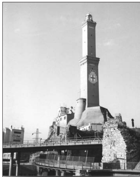
The lighthouse of Genoa today.