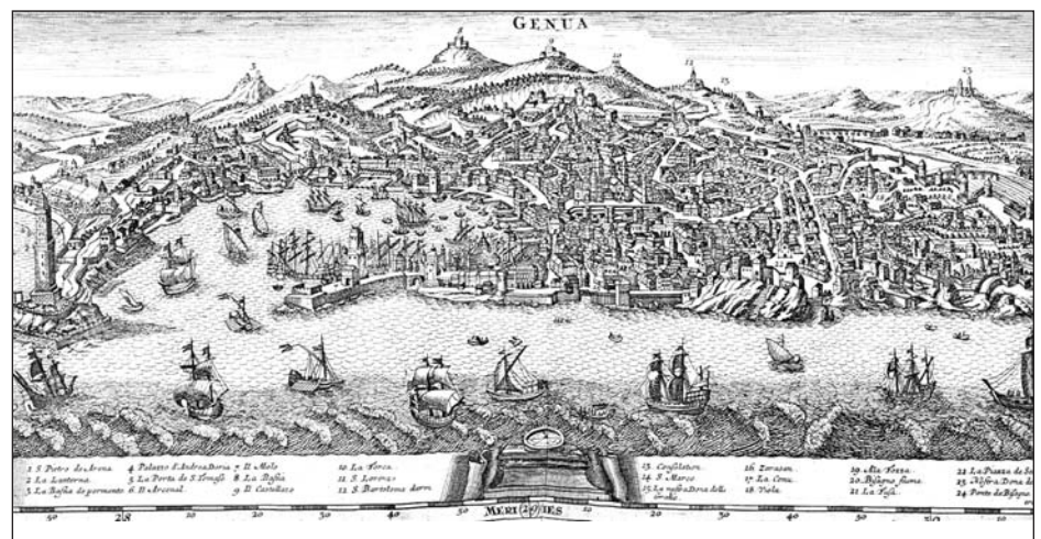
The harbor of Genoa in 1700 from an ancient print.

But let's go back to the past. The tower was located on a high rock. Arriving from the sea it was a safe and beautiful view, but it was badly exposed to the storms. There are records stating how many times the tower was struck by lightning, which caused severe damage to the lighthouse and even severely injured some keepers. This happened in 1596 and in 1602. Not having any other defense, the keepers asked that some marble slabs, on which prayers were carved,