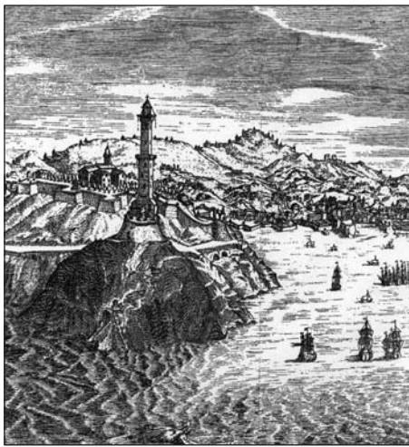
The lighthouse of Genoa as it was in 1543 from an ancient print.

the base of the lighthouse. Unfortunately, one of the cannonballs fired by a Genoese galley hit the tower in the middle, and the upper part collapsed. The French were defeated and left Genoa, but the town had lost its lighthouse.