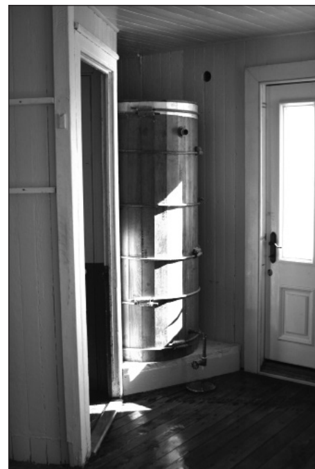
Below: Cistern at Thomas Point Shoal Lighthouse in Maryland.

dry summer months plugs were inserted in the holes. After the first rain washed the surface clear of bird droppings and other debris, the plugs were pulled, allowing the next rains to fill the cistern. Water was pumped from the cistern up into a 20,000-gallon redwood tank. At San Luis Obispo Light Station, a large rain catchment surface was installed on a slope behind the dwellings to capture rain water.