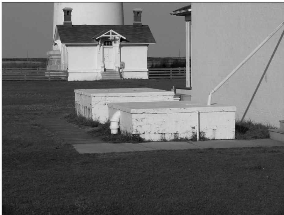
Cisterns at Bodie Island Lighthouse, North Carolina, 2002.

were periodically provided water by a buoy tender. At Point Retreat the ship would lie along the dock and pass water to the station by water lines (hoses). At Eldred Rock there was no pier or dock. The buoy tender would arrive on a calm day at low tide, place the bow of the vessel on the rocky shore, and “ride” the tide up while a water line was placed ashore. Most Alaskan buoy tenders had reinforced (ice breaker) bows. The ship would maintain a few turns of the screw